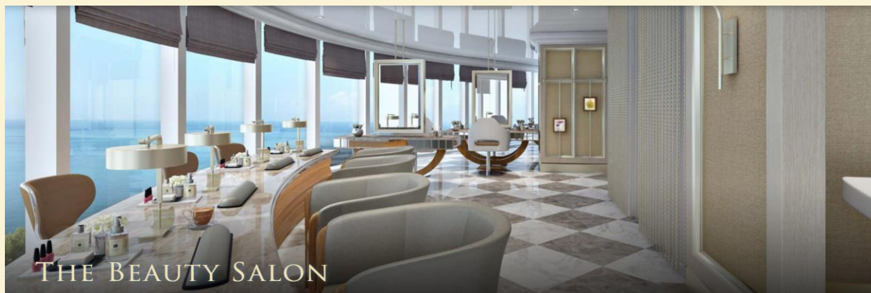
THE BEAUTY SALON 3 rd Floor, Pearl Wing, Okada Manila, New Seaside Drive, Entertainment City, Paranaque City 1701, Metro Manila, Philippines +632 555 7555 . theretreatspa@okadamanila.com